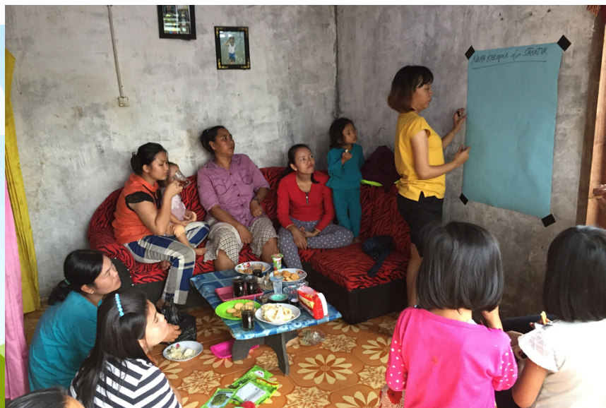
Preparation for Building a Local Food Based Business. Tebat Pulau, 7 Juli 2019