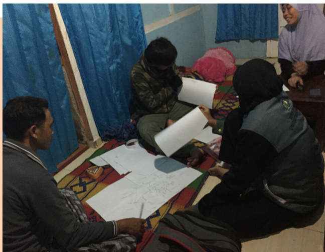
Inventory and Identification of Potential Local Foods. Tebat Pulau, 9 Mei 2019