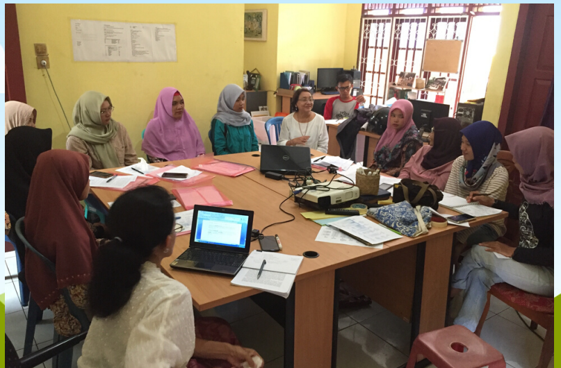
Training of Gender & Social Inclusion. Akar Office, 16-17 Mei 2019